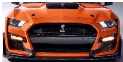
2020 GT 350