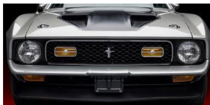
1971 Mach 1