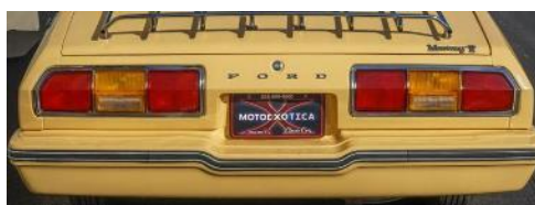
1977 Mustang II