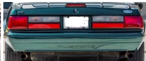
1990 LX Mustang