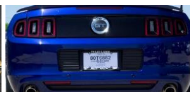
2013 Mustang GT