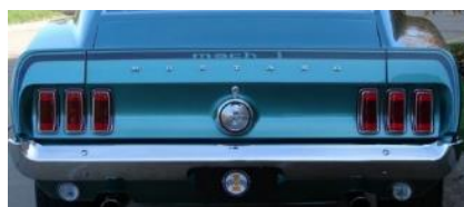
1969 Mach 1